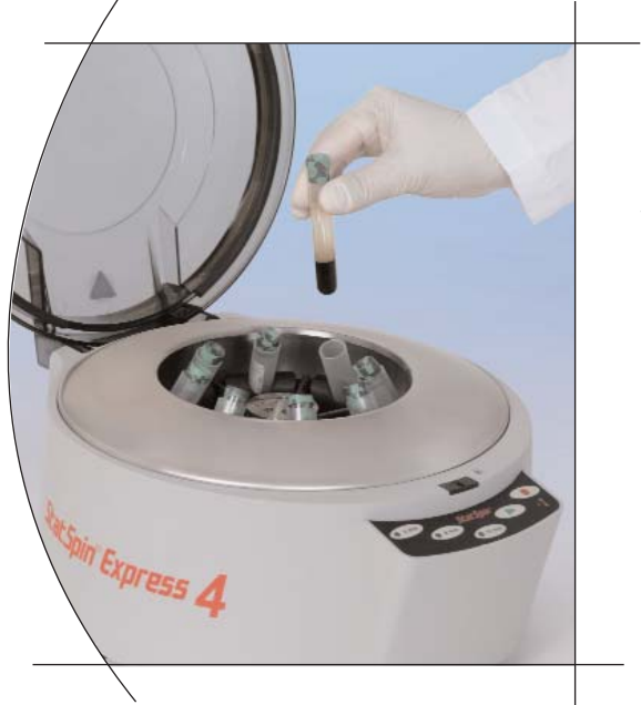
Gel tubes are separated in just 3 minutes

Horizontal spin provides a flat gel barrier