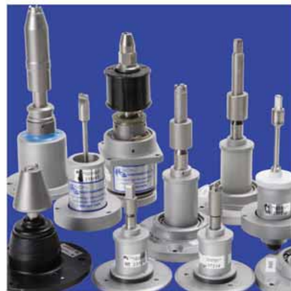
Spindles & Gyros

Switches Motor Mounts Lid Stays Timers Overlays Fuses Tachometers Bearings Armatures New Parts Used Parts Hard-to-Find Parts Wiring Harnesses Relays Solenoids